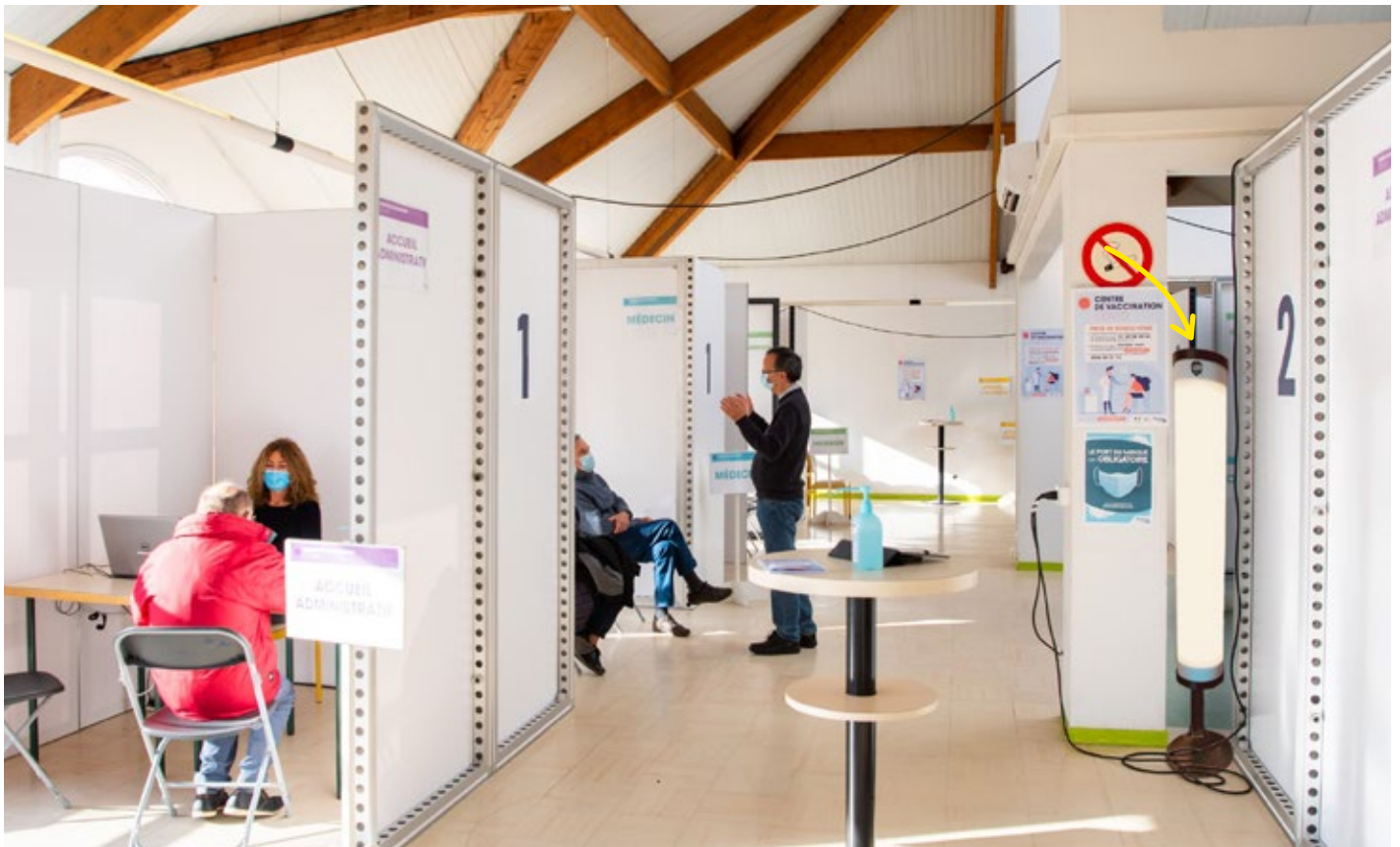
Closer to the Anti-COVID fight