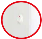
SWITCH LED «LIGHTING»