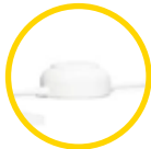
SWITCH LOD «DISINFECTION»